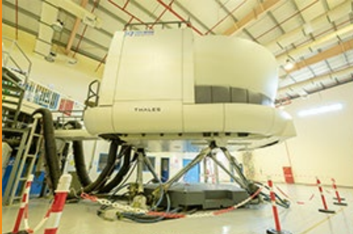
Full-Flight Simulator Airbus A320-NEO